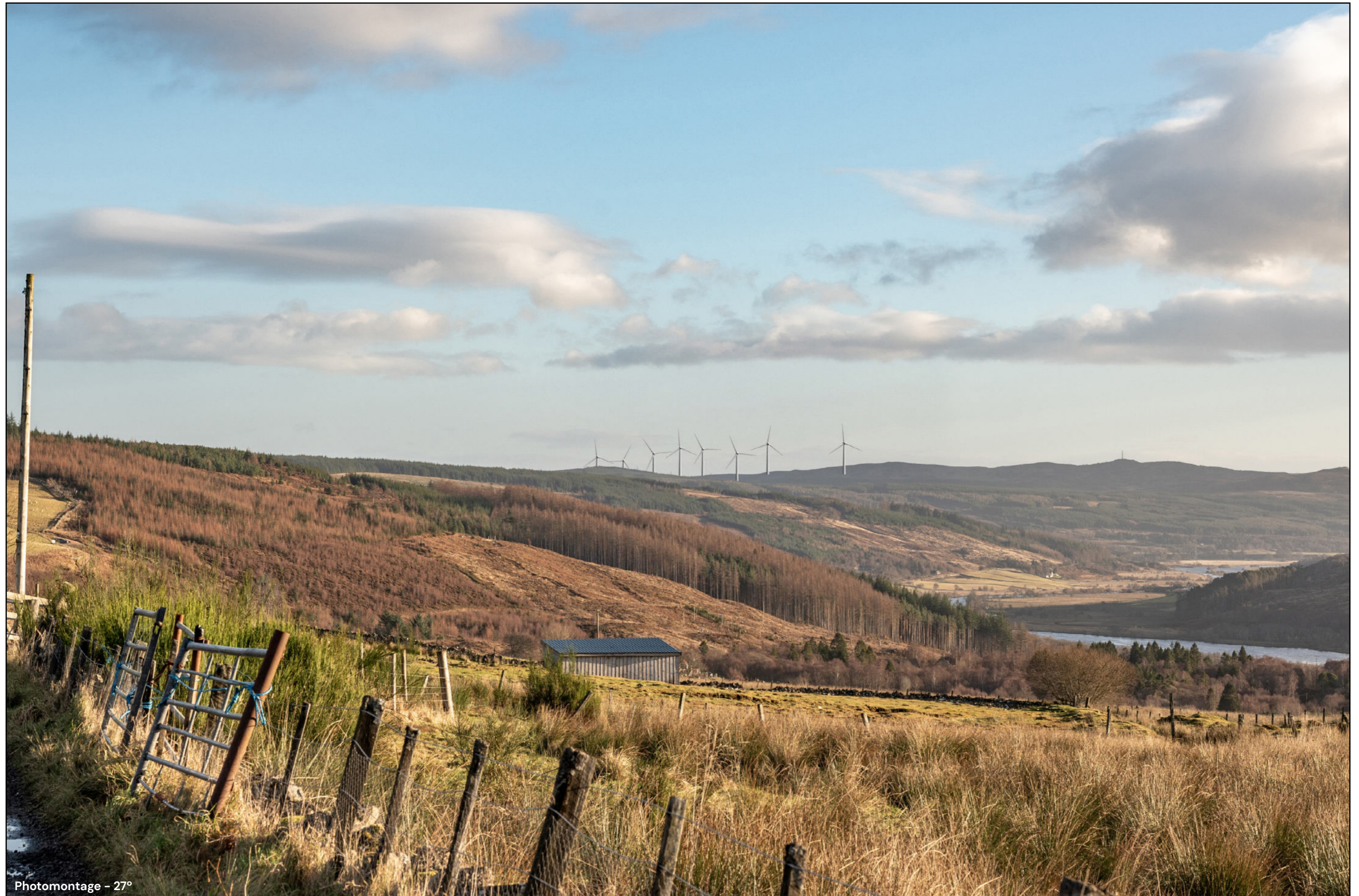
Photomontage - 27°