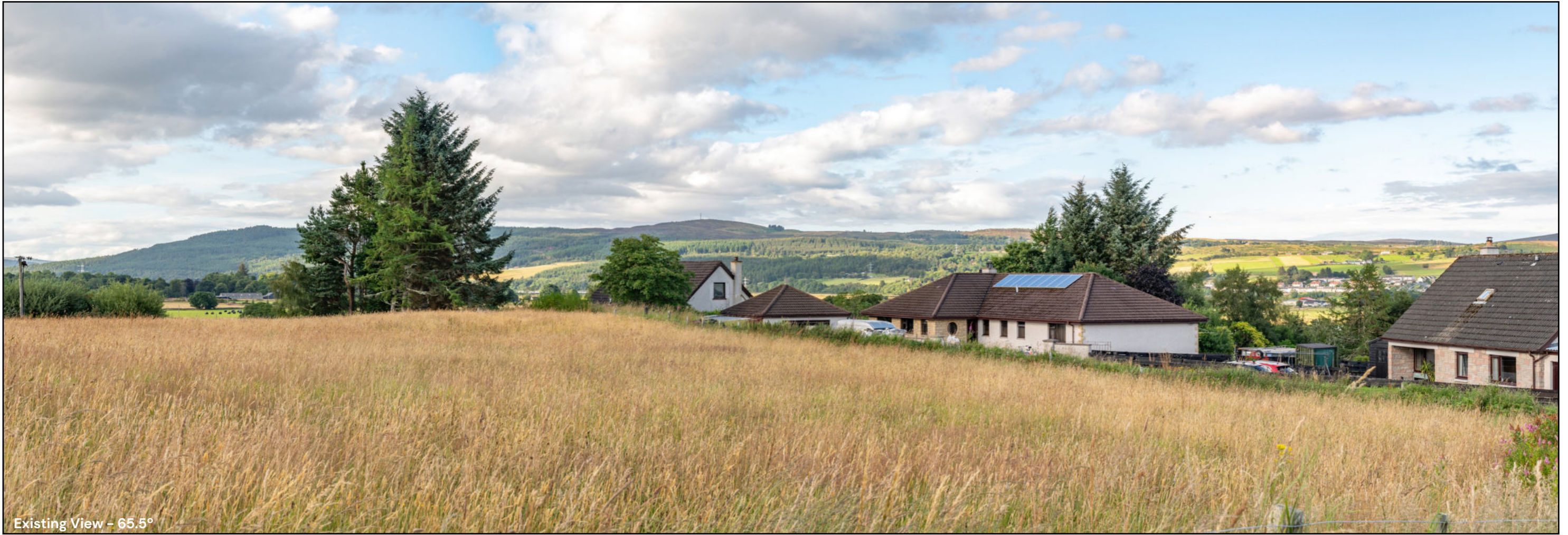
Existing View - 65.5°