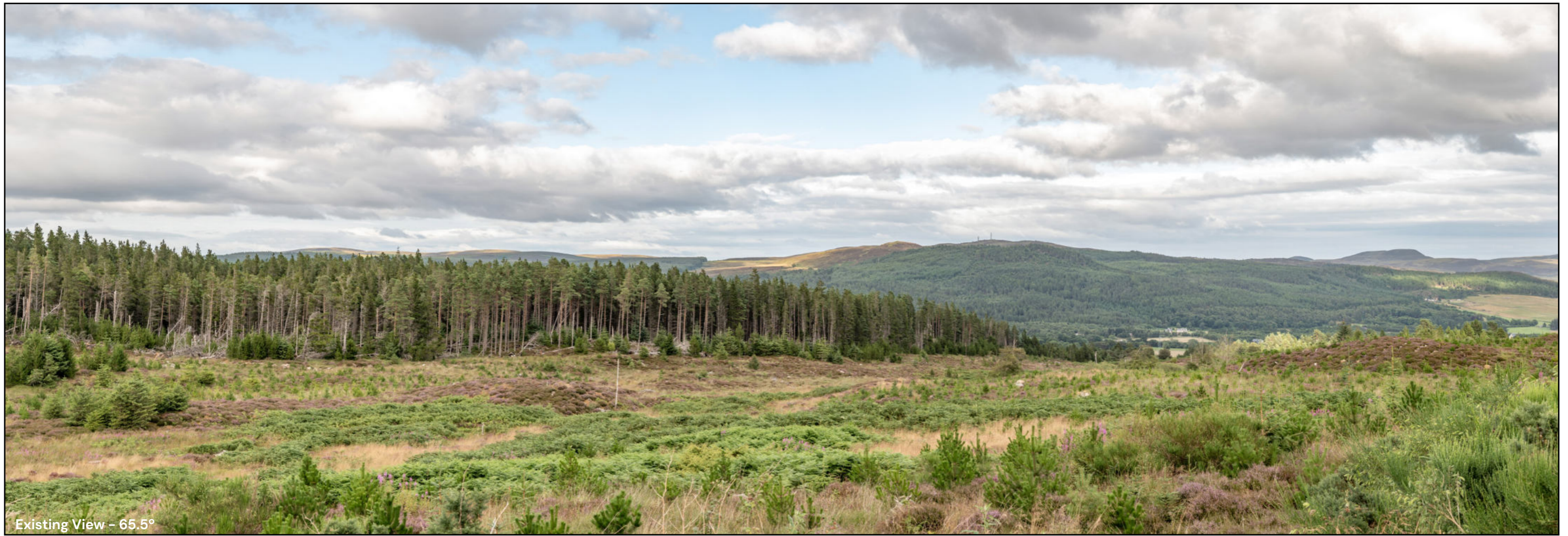
Existing View - 65.5°